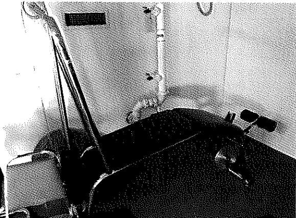
District Inventory Tag